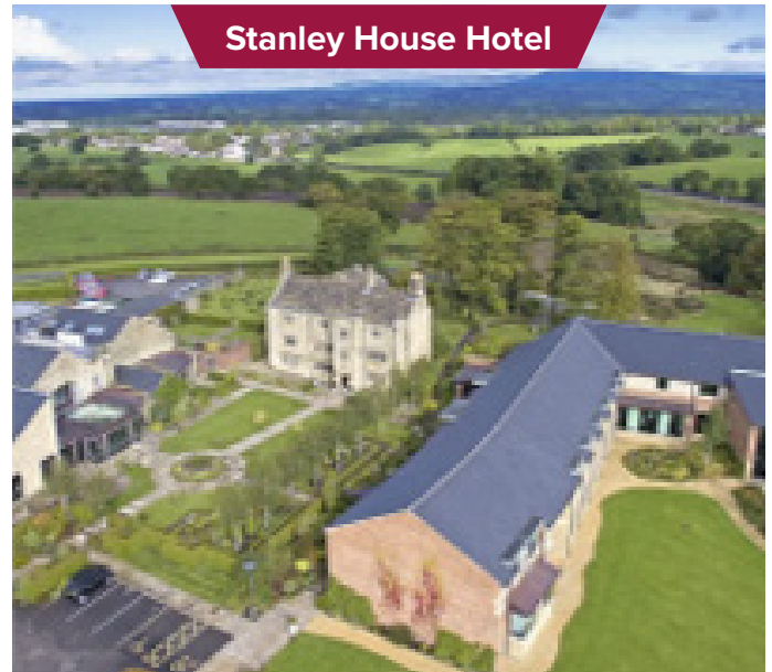
Stanley House Hotel