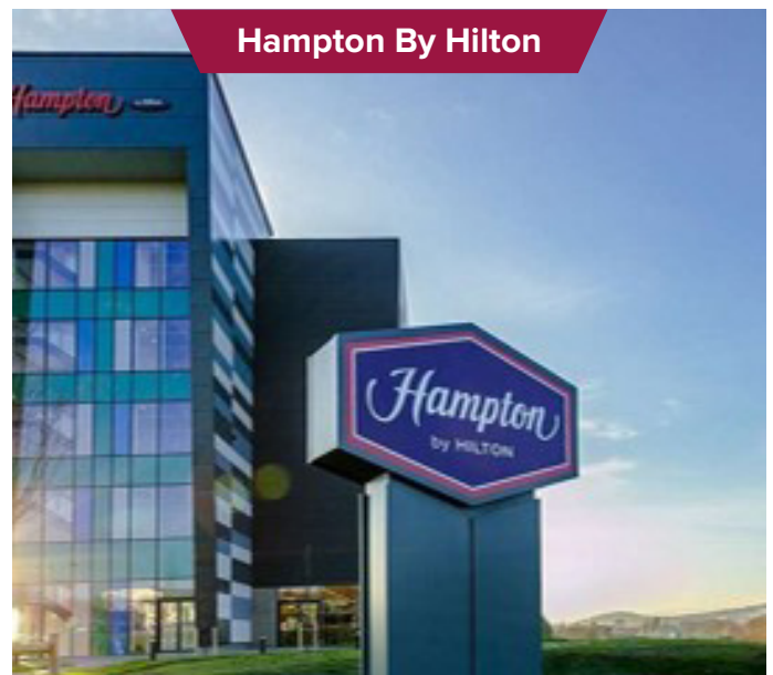
Hampton By Hilton